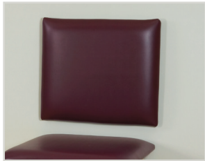
717 Option Upholstered Wall Mounted Backrest Pad