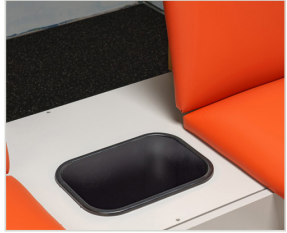
715 Option Drop-In, Waste Hamper for Taping Stations