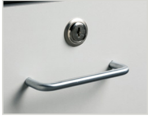
710 Option Door/Drawer Locks