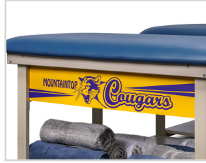
721 Option Team Logo Side Panels/ Ironside