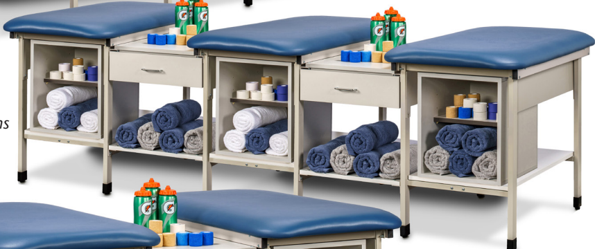
31703-3 Three Stations