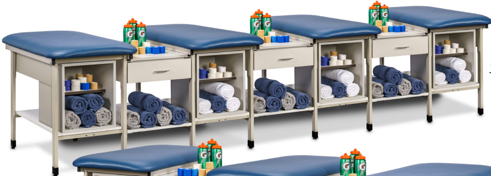
31703-4 Four Stations