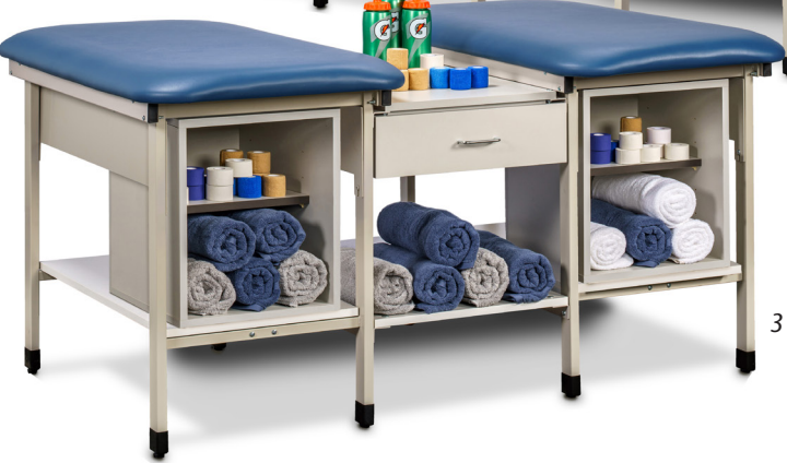
31703-2 Two Stations