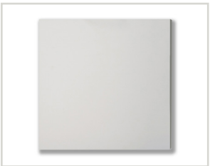
718 Option Laminated Hook & Loop Wall Board