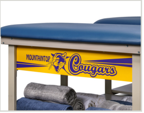
721 Option Team Logo Side Panels/ Ironside