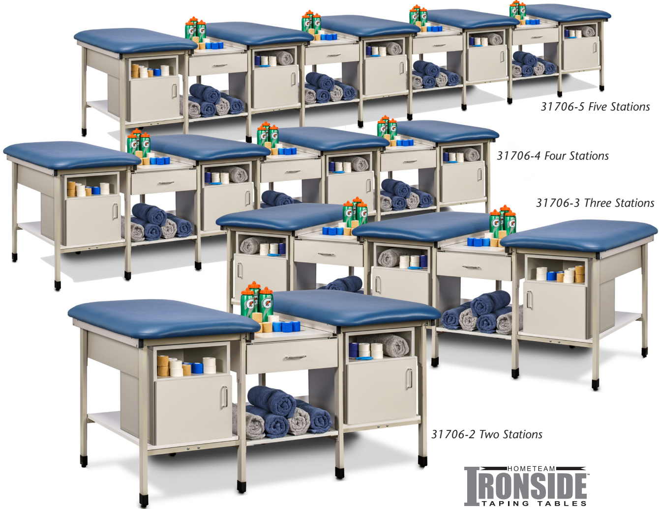
31706-5 Five Stations