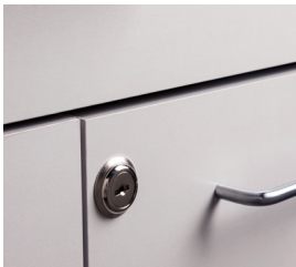
055 Door Locks