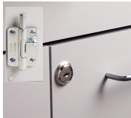
066 Door Lock & Inside Latch Combo