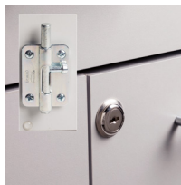
066 Door Lock & Inside Latch Combo