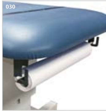
030 Paper Dispenser • Accommodates paper rolls from 18" (45.72cm) to 21" (53.34cm) wide